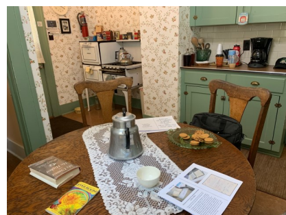
The rooms where it happened !